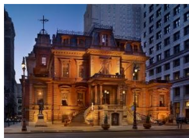
The Union League

Philadelphia is a fitting venue for this Conference, as it is considered the cradle of liberty in American history. It was the social and geographical center of the original thirteen American colonies and served as the nation’s capital during the Revolutionary War. Philadelphia was home to Benjamin Franklin and other political philosophers whose ideals led to the American Revolution and independence. The city hosted the First Continental Congress; the Second Continental Congress, which crafted the United States Declaration of Independence; and the Constitutional Convention after the war.